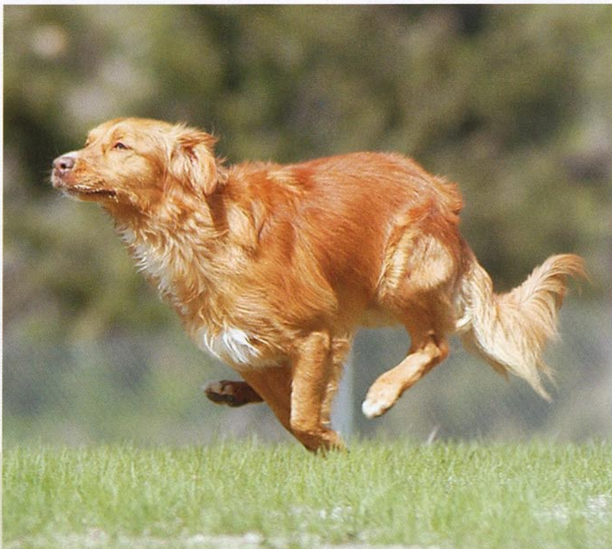
TOP DOG PHOTOS

The Nova Scotia Duck Tolling Retriever Club (USA) offers a judges' PowerPoint presentation and corresponding materials. E-mail: IsToller@aol.com; web: www.nscdtrc-usa.org.