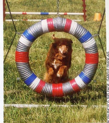
A born athlete: The Nova Scotia Duck Tolling Retriever has the speed, balance, and brains of a natural agility dog.

• "We've heard a thousand times, 'Gee, it's a Golden